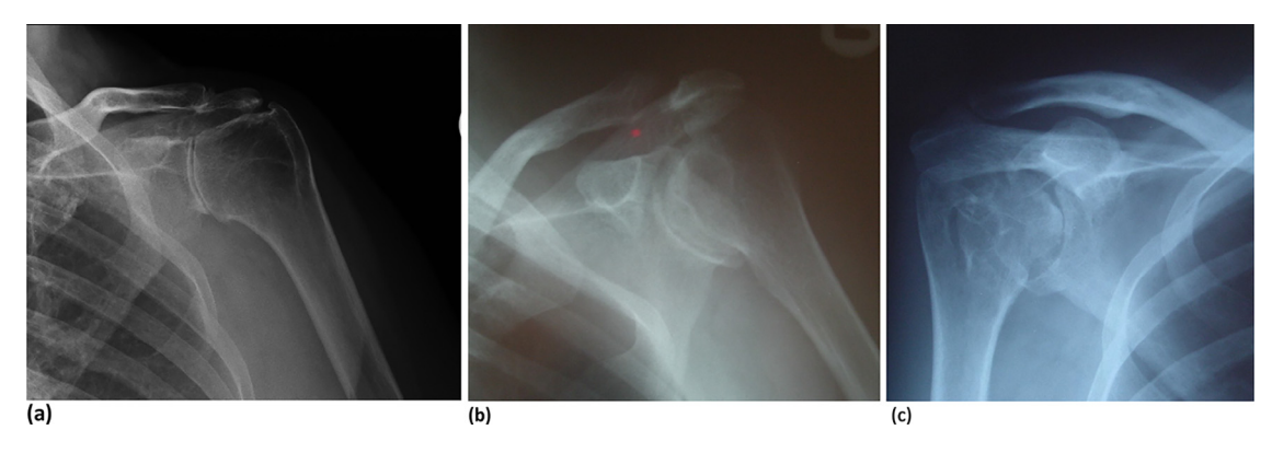
Figure 2 Preoperative anteroposterior radiographs of 3 patients. (a) Larsen IV changes with superior head erosion and advanced acromioclavicular joint disease. (b) Larsen IV changes with glenoid erosion, early metaphyseal notching, and greater tuberosity overgrowth. (c) Larsen V changes; severe distortion of the humeral head and glenoid erosion.